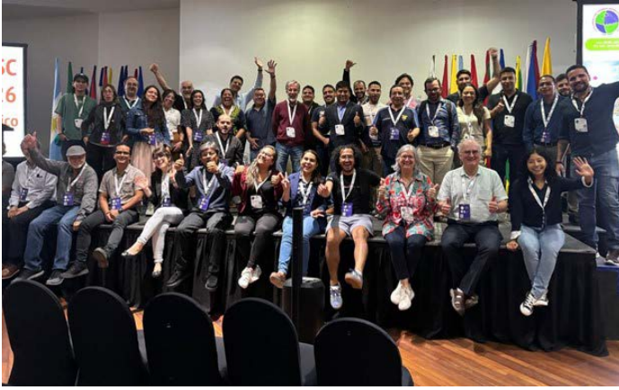
Group photo during the LACSC Assembly on 27 June 2024

knowledge and exchange insights on critical methodologies shaping the field. The Assembly featured a keynote talk on DAS, emphasising the latest advancements and applications in an area of growing importance for the region's seismological community. Additionally, two panel discussions provided essential forums for expert dialogue on seismic hazards in Latin America and the Caribbean and the development of building codes tailored to improve resilience against seismic activity.