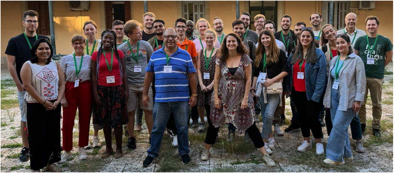
Participants of the Peter Bormann Young Seismologists Training Course (YSTC)

the 2024 ESC-SSA Travel Grant to attend the ESC General Assembly and participate in the Peter Bormann Young Seismologists Training Course (YSTC).