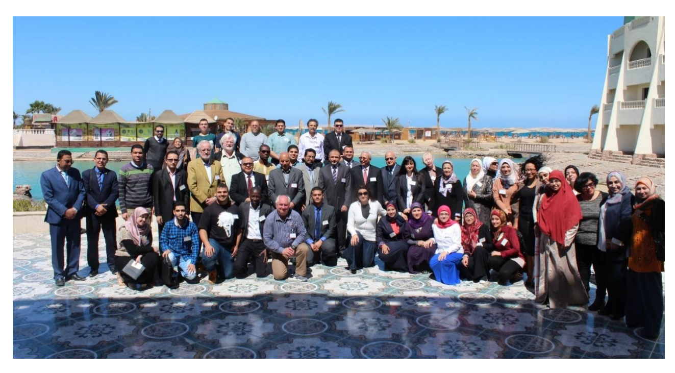
Group photo of the Symposium's participants

Peer-reviewed contributions based on the presentations will be published as a special issue of the Cairo University Journal of Advanced Research (an Elsevier publication). More information on the symposium can be found at: <u>http://iaga.cu.edu.eg</u>.