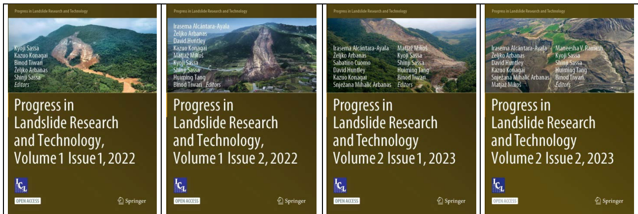
Four book covers of the ICL Open Access Book Series ‘P-LRT’ in 2022 and 2023