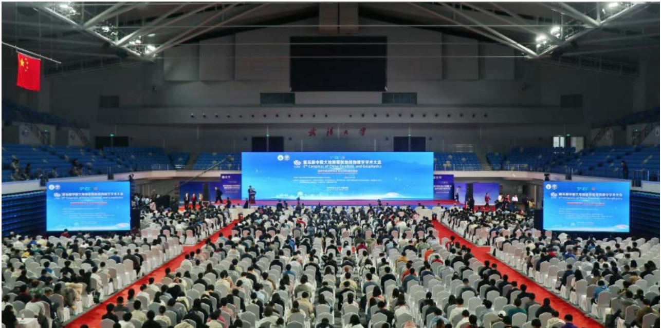
Participants of the 5th CCGG in Wuhan, China

The theme of the 5th CCGG was ‘Earth System Sciences and Large River Sustainable Development’. 16 academicians from the Chinese Academy of Sciences and the Chinese Academy of Engineering, together with more than 3,900 scientists and students from over 300 universities, research institutions and other organisations gathered in Wuhan to exchange their scientific achievements, ideas and visions.