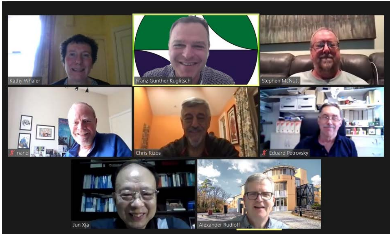
Greetings from our last Bureau Meeting on 20 May 2021

Due to the COVID-19 pandemic all IUGG Business Meetings 2021 will be held online. This includes the regular meetings of the Bureau as well as the meetings of the Executive Committee (15-16 September 2021), the Finance Committee, the Scientific Program Committee in preparation for the IUGG General Assembly 2023 in Berlin, and others.