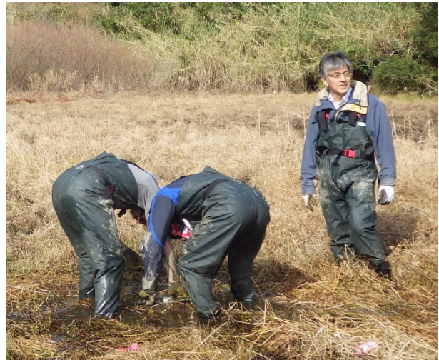
Searching for evidence of past earthquakes and tsunamis in the field

At the 2011 IUGG General Assembly in Melbourne, Australia, a few months after the Tohoku Earthquake and Tsunami, I completed my tenure as the chair of Joint Tsunami Commission, and became an IUGG Bureau Member. At the 2015 IUGG General Assembly in Prague, Czech Republic, I became a Vice-President of IASPEI, at the 2019 IUGG General Assembly in Montreal, Canada, I was elected IASPEI President.